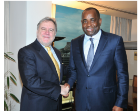
Pictured above from left: The Honourable Roosevelt Skerrit, Prime Minister of the Commonwealth of Dominica, pictured during his meetings in Athens with Prime Minister Alexis Tsipras; Minister of Maritime Affairs and Insular Policy Panagiotis Kouroumbilis; and Alternate Foreign Minister George Katrougalos.

The Honourable Roosevelt Skerrit, Prime Minister of the Commonwealth of Dominica was on a working visit to Greece from January 26th-30th, during which time he met individually with Prime Minister Alexis Tsipras, Minister of Maritime Affairs and Insular Policy Panagiotis Kouroumbilis and Alternate Foreign Minister George Katrougalos.