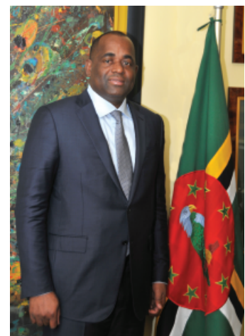
THE HONOURABLE ROOSEVELT SKERRIT, PRIME MINISTER OF THE COMMONWEALTH OF DOMINICA

The visiting Prime Minister thanked Minister Katrougalos for Greece's positive stance within the EU, particularly on the issue of waiving Schengen visas for citizens of Dominica, and also noted his country's interest in the future signing of a bilateral agreement in the shipping sector.